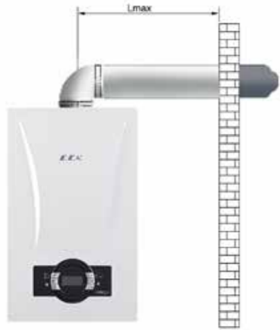
Horizontal Hermetic Flue Application L max. distance with single elbow: 10 m, Ø60/100 L max. distance with single elbow: 20 m, Ø80/125